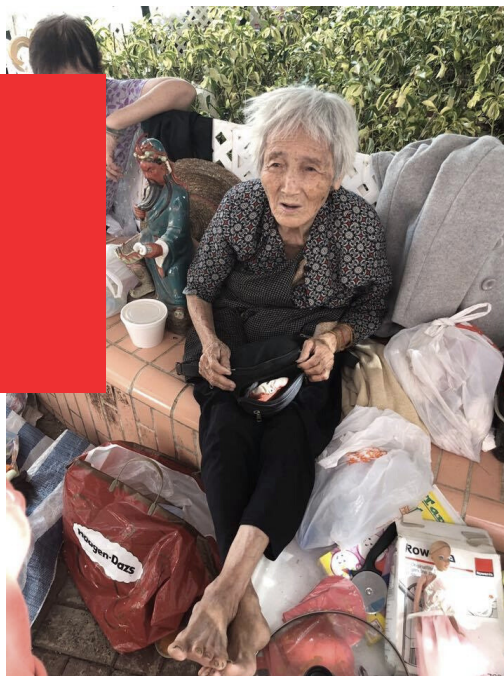
Por Por in Mong Kok garden